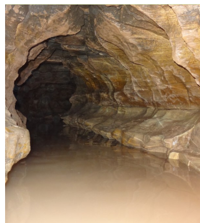
Cave passage during high water

Across the road (and through the field) from FRANK E. MURPHY COUNTY PARK 7119 Bay Shore Drive, Egg Harbor WI 54209. Follow the signs.