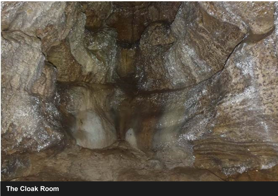
The Cloak Room