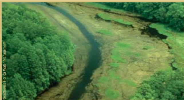
Southwest Florida Water Management