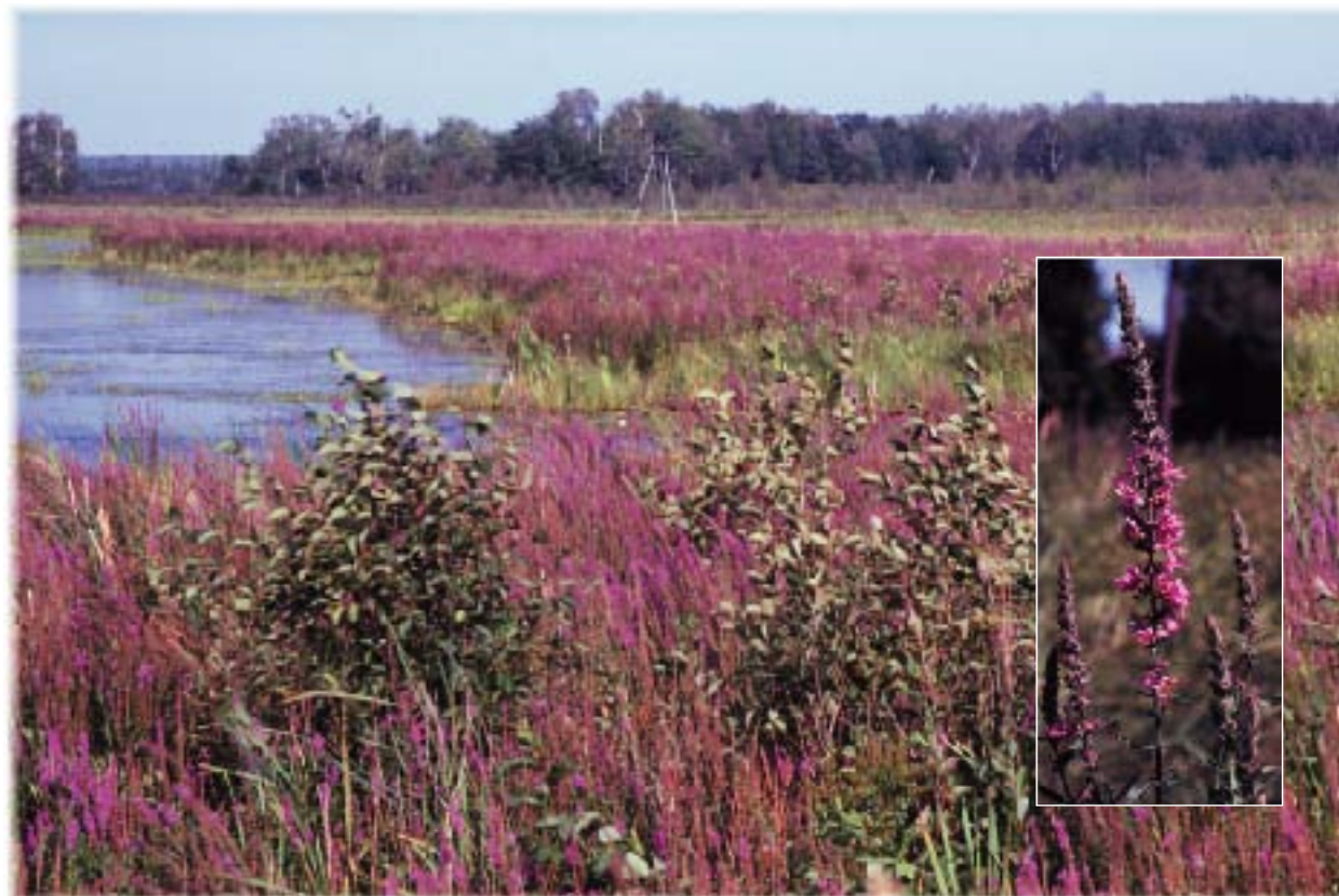
Once a popular garden plant, purple loosestrife is now illegal in many states because it invades and threatens our wetlands.

Can you meet this bill? Every year the costs associated with non-native weeds approach and exceed $35 billion in the United States alone. Source: Pimental, D et. al., 1999.