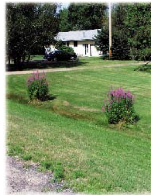
Landscape plants don't always remain confined to our yards.