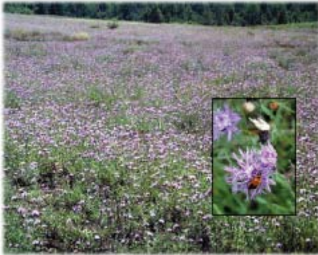
Spotted Knapweed overruns open pastures, barrens and rangelands.

A weed, by definition, is any plant that is unwanted and grows or spreads aggressively. When we hear "weed," we often think of dandelions. But many weeds are much more destructive than common lawn pests. Exotic weeds that overrun natural habitats, agricultural lands, and waters reduce biodiversity and burden our economy.